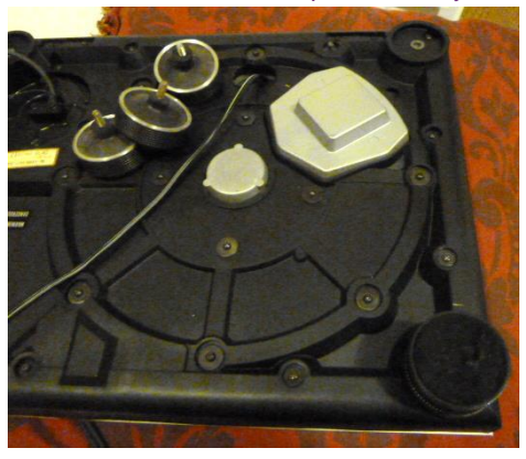
Step 5 ; Remove the three tonearm screws Also the earth wire.