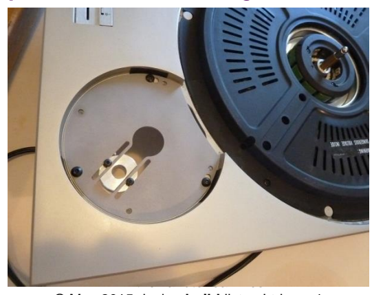
© May 2015 design build listen Ltd.