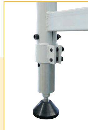
Model Ref. TR3 with optional swivel casters Ref. TR3-ROUL