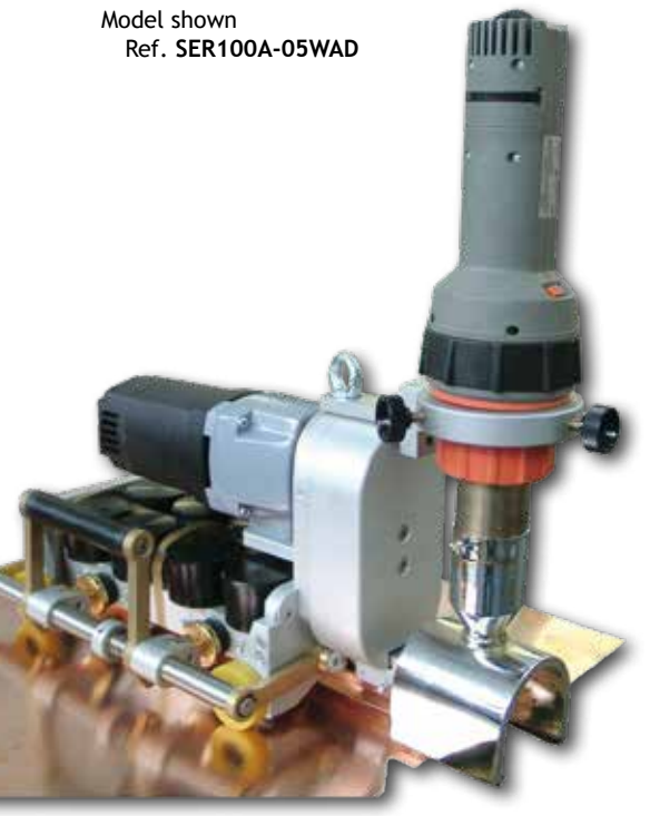
Model shown Ref. SER100A-05WAD with the option SER-05SETHIVER