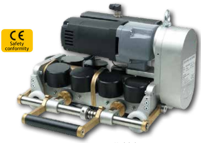
Model shown Ref. SER100A-05