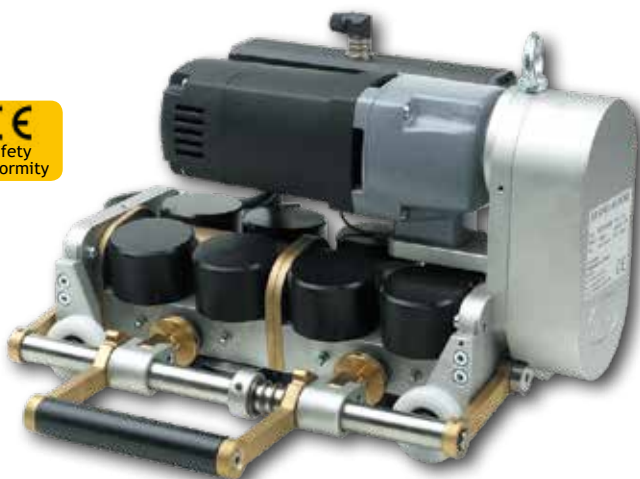
Model shown Ref. SER100A-05