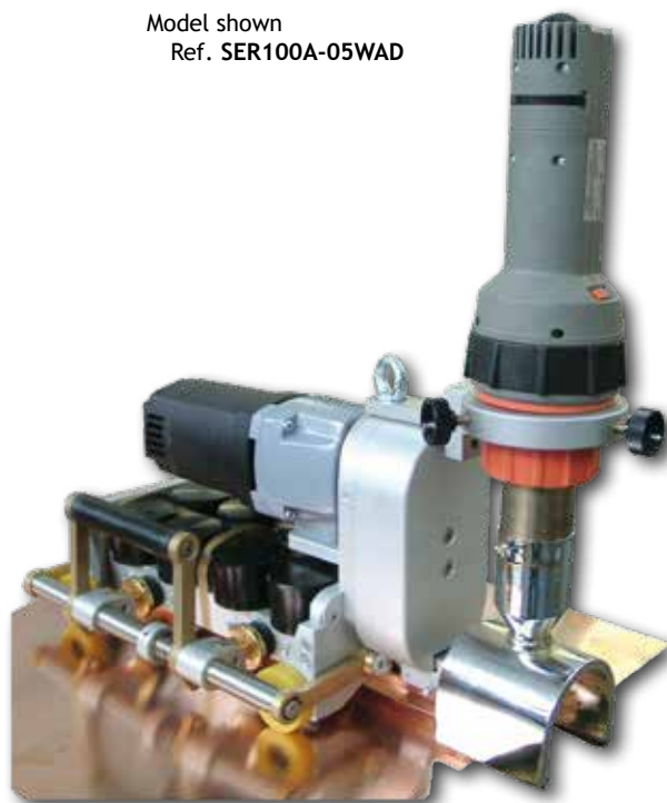
Model shown Ref. SER100A-05WAD with the option SER-05SETHIVER