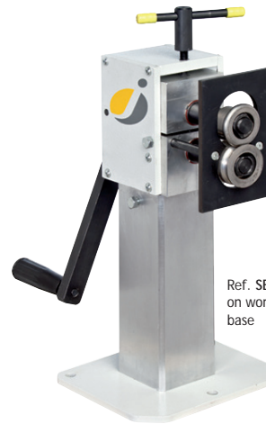
Ref. SB3M on workbench base