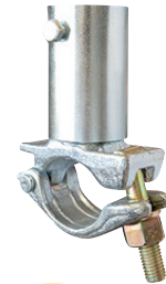
Scaffolding attachment included