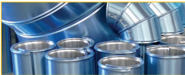
A large selection of rolls to flare, flange, bead, shear or swag