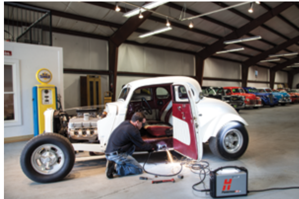
Vehicle repair and modification