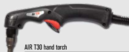
AIR T30 hand torch