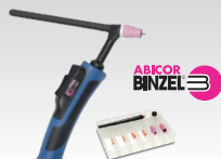
SR17DB - 4 m 046009