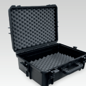
Heavy-duty IP67 work case 060432