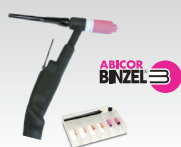
SR9L - 4 m 044432