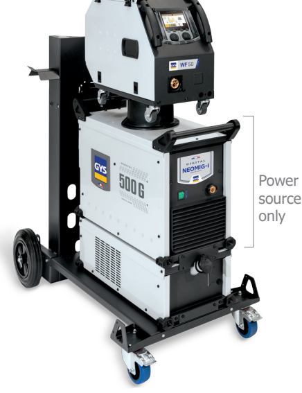
Delivered without accessories, with no additional elements (power source only)