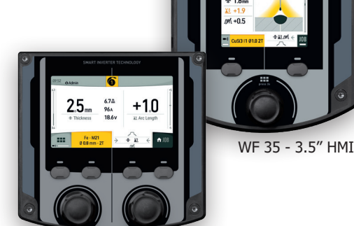
WF 50 - 5" HMI