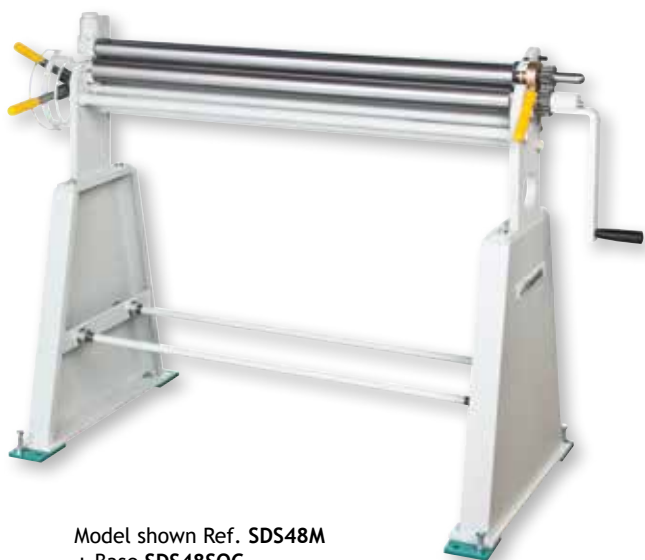
Model shown Ref. SDS48M + Base SDS48SOC