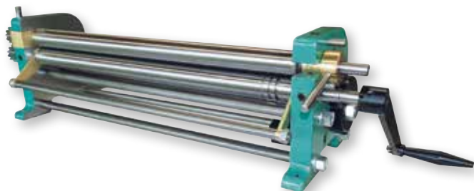
Model shown Ref. CACDS33

Asymmetrical roll-bending machines for levelling, pinching and roll-bending of small diameters ( \emptyset of the roller* x 1,5 = \emptyset of the hoop, approximately)