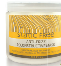
ANTI-FRIZZ RECONSTRUCTIVE MASK

Shea Butter, Wheat Amino Acids, Jojoba Oil, Vitamin E, Active Botanical Extracts.