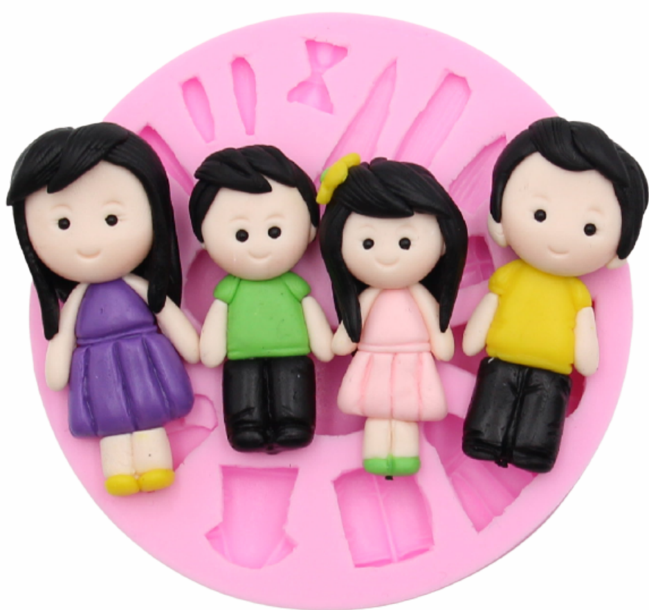
Family Silicone Mould