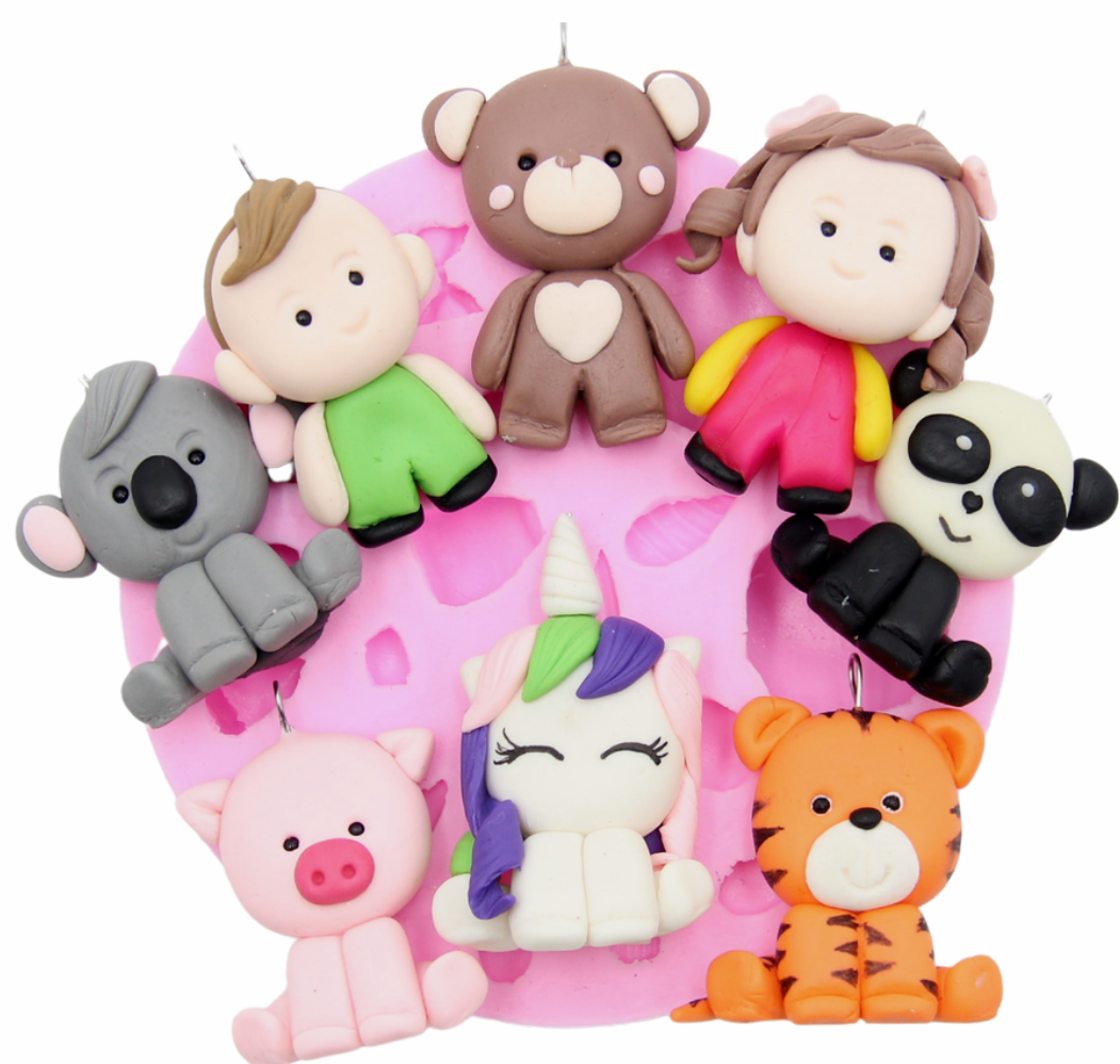
Unicorn and Animal Silicone Mould