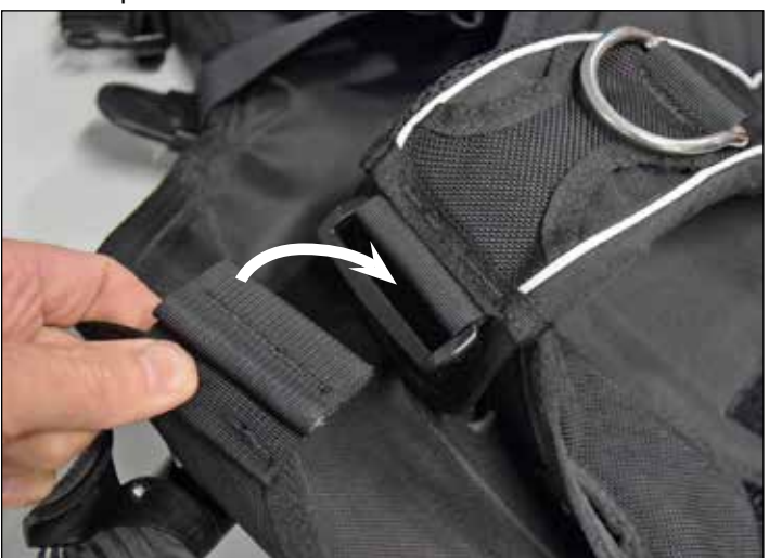
5 Thread the T-shaped webbing end upwards thru the slot on the bottom of the backpack until it is captured.

4 Turn the BC over, thread the T-shaped webbing end downwards thru the slide on the shoulder until it is captured. Repeat for other side.