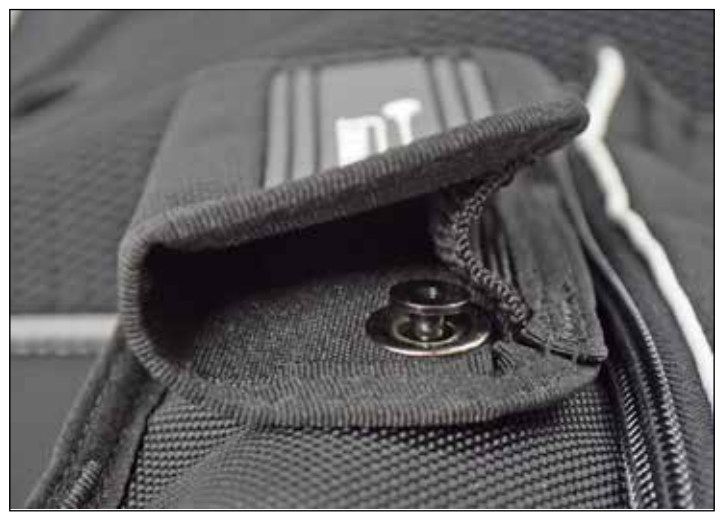
Literature p/n 18491 rev 11/19