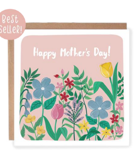
Happy Mother's Day 14.8cm x 14.8cm