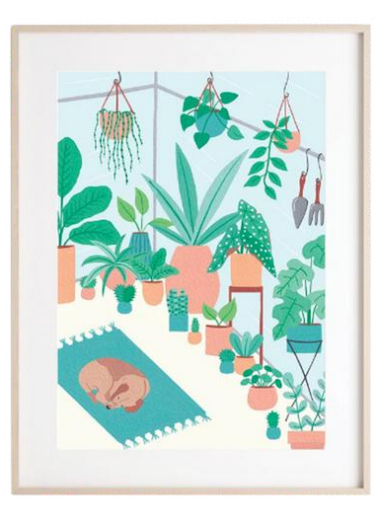
Beagle Pant Room