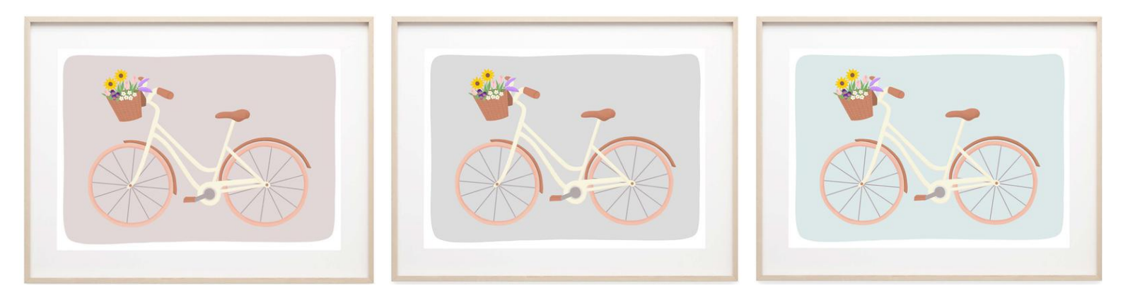
Floral Bike Purple