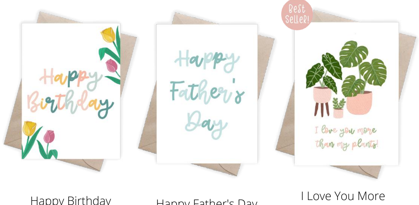
Than My Plants