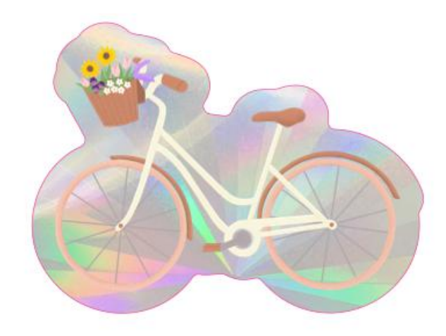
Floral Bike 4/5" x 3.3"

Sun Catchers: Our new sun catchers transform sunlight into colourful rainbows! These magical window decals have been extremely popular with our customers.