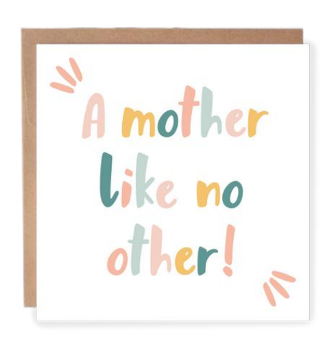
A Mother Like No Other 14.8cm x 14.8cm