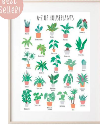
A-Z of Houseplants