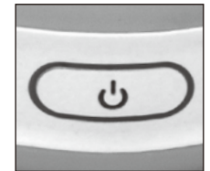
Power Button / Vibration Control