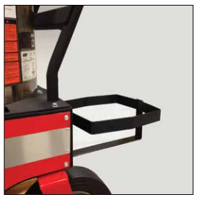
Optional Detergent Bucket Bracket