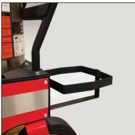
Optional Detergent Bucket Bracket