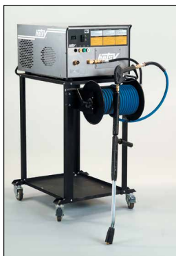
1700 Series shown with optional hose reel kit (PN 8.903-039.0) and Tall Floor Stand (PN 9.801-034.0).