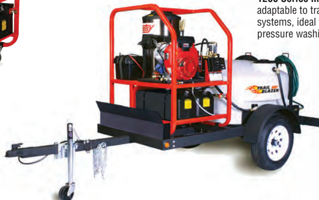
1200 Series with LC2V80F-D Engine

1200 Series models are easily adaptable to trailer-mounted systems, ideal for mobile pressure washing