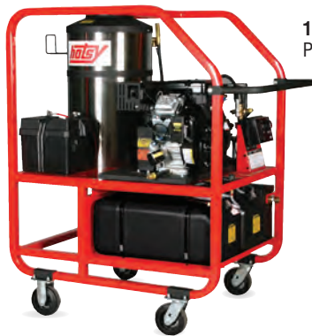
1270SS (shown with optional Portagear Kit)

Hotsy-designed Triplex pumps carry a 7-year limited warranty and Heater coil carries a 5-year warranty.