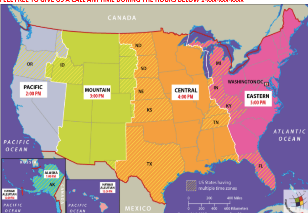
FEEL FREE TO GIVE US A CALL ANYTIME DURING THE HOURS BELOW 1-xxx-xxxx

We welcome and value all concerns and questions from our customers. Please do not hesitate to contact us for product support, warranty, and maintenance related questions directly at: 1-xxx-xxxx from 9:00AM-4:00PM EST MONDAY-FRIDAY or by email at <a href="mailto:support@omnifogusa.com">support@omnifogusa.com</a>