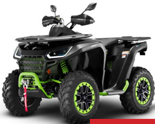
BOLD BLACK & GREEN