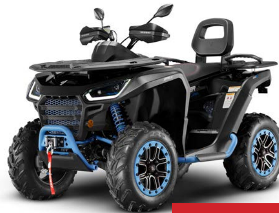
INNOVATIVE GREY & BLUE