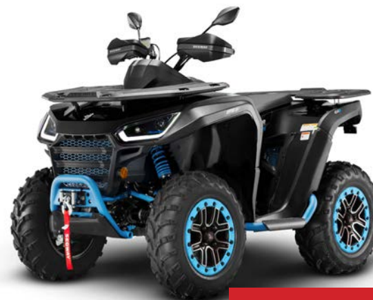
INNOVATIVE GREY & BLUE