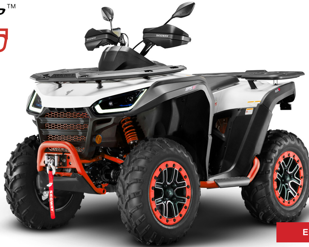
ELECTRIC WHITE & RED