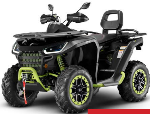
BOLD BLACK & GREEN