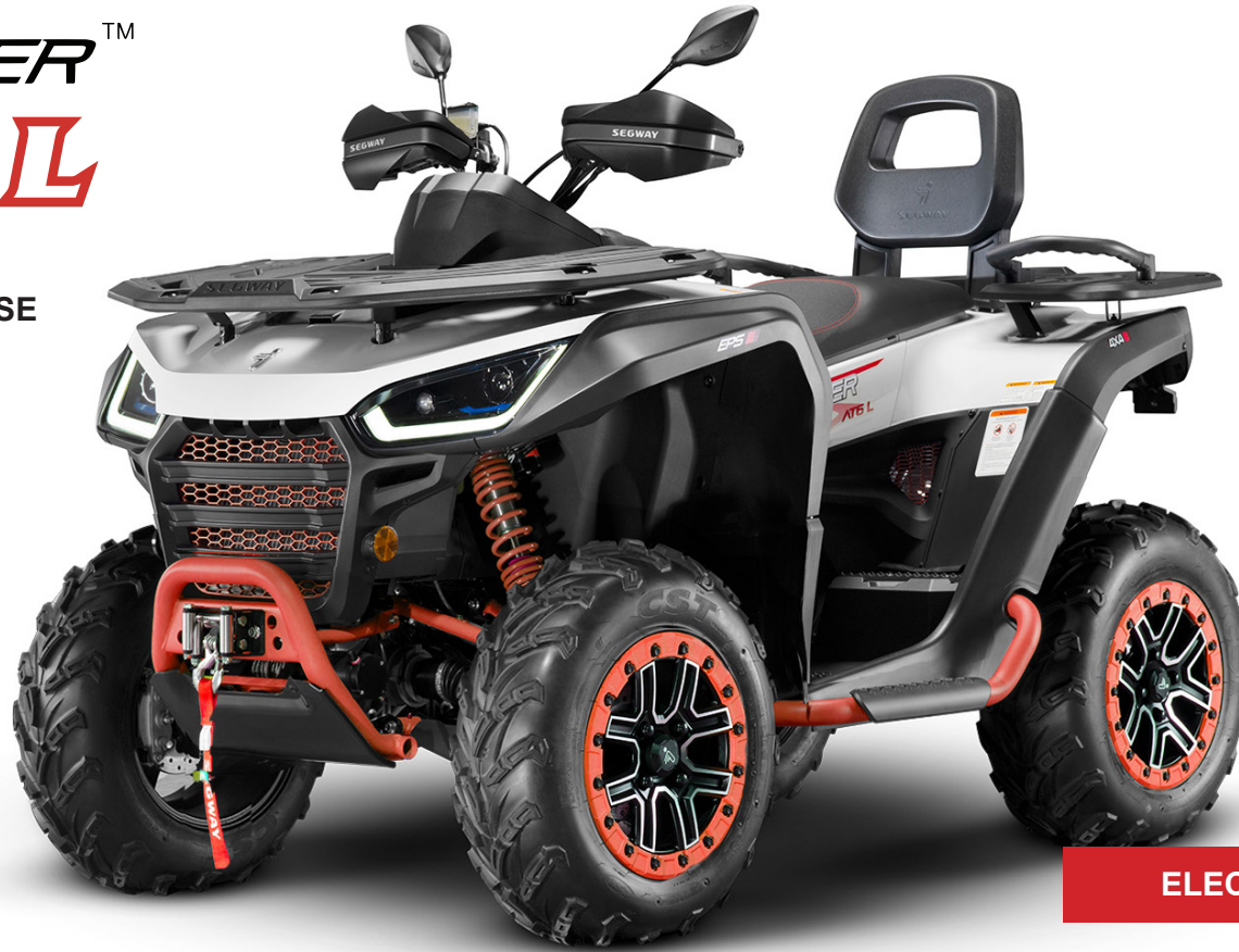
ELECTRIC WHITE & RED