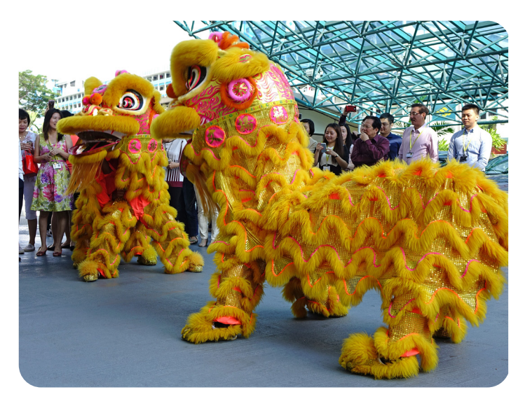
Figure 54.2 - Collectivism is part of Chinese culture

In a corporate setting, individualistic cultures put emphasis on the needs of the individual over the needs of the group as a whole. By contrast, a collectivist culture stresses the importance of cooperation and interests of the group over than the needs of any particular individual.