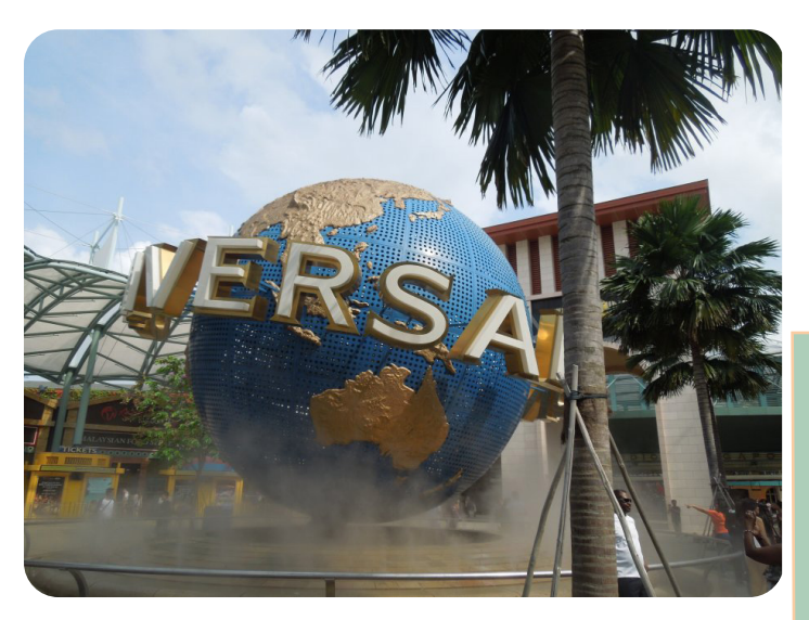
Figure 54.1 – Universal Studios, Singapore

Hofstede's research gives insight into how organizational cultures may differ from one country to another. National culture has a direct impact on organizational culture. For example, Universal Studios Singapore opened its theme park in 2010 on 18th March at precisely 8:28 a.m. with 18 Chinese lions blazing through the entrance. The number 8 is auspicious in Chinese culture. It is important for organizations with operations in overseas markets to consider the cultural differences that exist. What works well in one culture or country does not necessarily apply to others (also see Chapter 34).