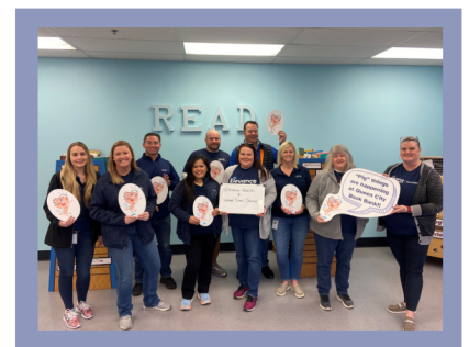
Elevance Health & United Direct Solutions