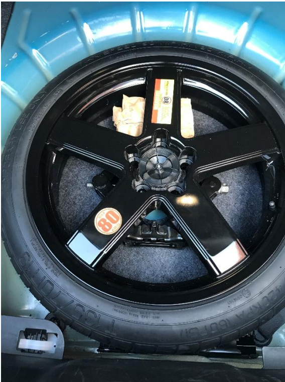
3: Place jack handle between tyre and wheel well