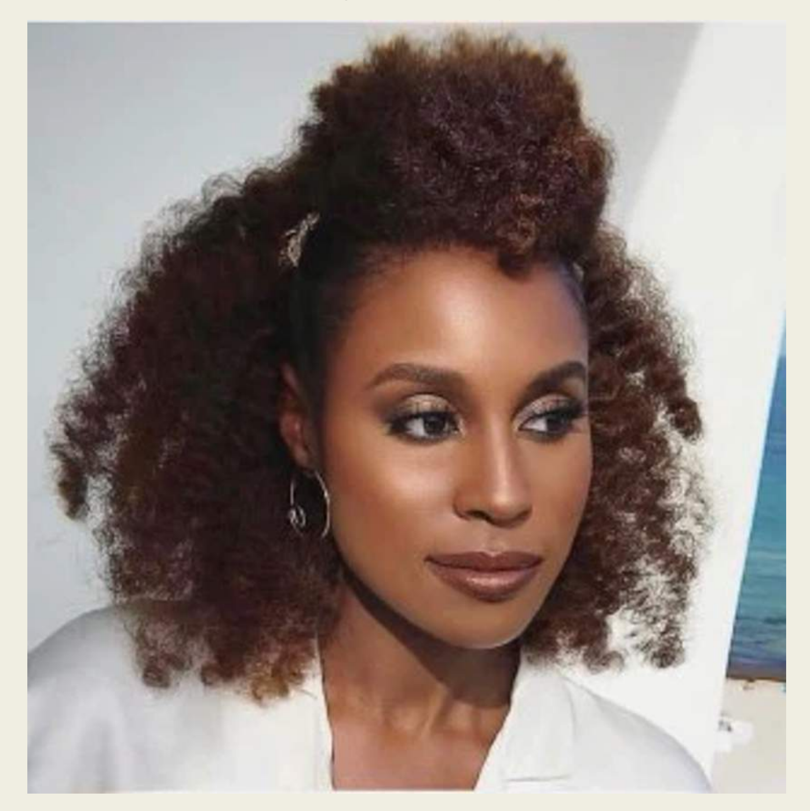
ISSA RAE IS ANYTHING BUT INSECURE IN HER TRUE+PURE TEXTURE LAYLA CURL