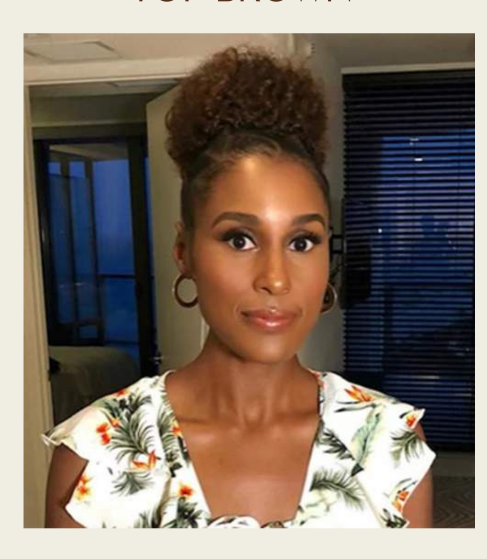
ISSA SLAYED IN 3 LAYLA CURL LOOKS STYLED BY <a href="mailto:open">open</a> (MIAMI FILM FESTIVAL)

ISSA WORE LAYLA CURL ON SEVERAL EPISODES OF INSECURE