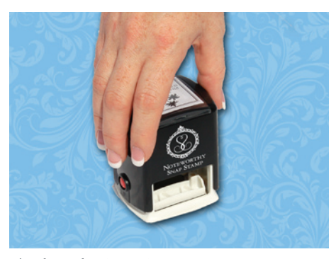
4. Place the Snap Stamp unit over your Snap Stamp face. You will hear a SNAP as the face is attached to the Snap Stamp unit.