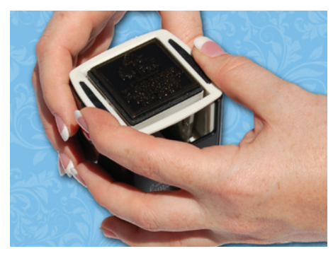
Turn the Snap Stamp unit upside down and push down the outer black and white edges to disengage the locking mechanism.