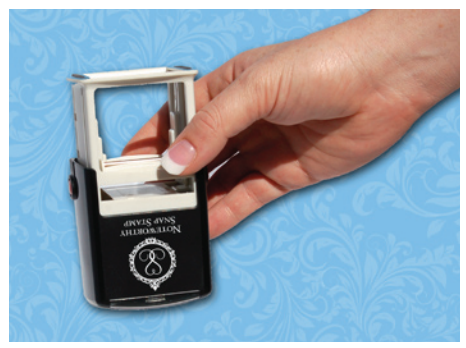
1. Hold your Snap Stamp unit upsidedown with one hand.