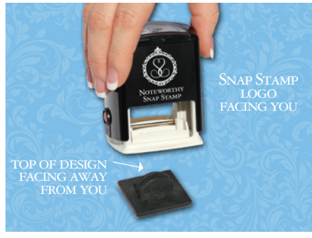
3. Turn the Snap Stamp unit right side up with the Snap Stamp logo facing you. The Snap Stamp face should be positioned face down with the top of the image oriented away from you.