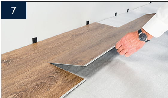
Figure 7: Continue alternating planks on rows 1 and 2. Insure planks are properly aligned along the chalk line and against the spacers. Finish rows 1 and 2 in this manner, cutting planks at the end of the row as necessary. Insure that the end planks are a minimum of 6" in length. If necessary, adjust the length of starter pieces to insure minimum plank lengths for each row, with proper end joint stagger row to row.

Installation of all additional rows will start by angling a plank on the long side, and sliding plank to the left until the short sides are in contact. Lock the short side as instructed for rows 1 and 2 using a rubber mallet to engage locking system as shown in Figure 5.