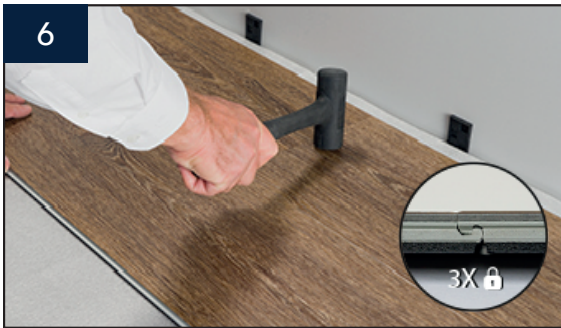
Figure 6: Using a rubber mallet, lightly tap the joint on the short side to engage the locking system.