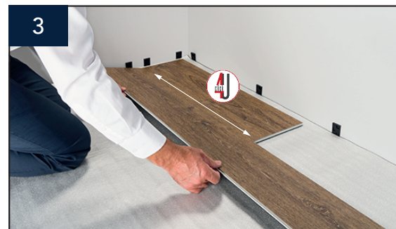
Figure 3: Use a full length for Plank 2 which will be installed in the second row. Align plank 2 at an angle, onto the long side of plank 1 making sure there are no gaps. Drop plank 2 to lock in place.