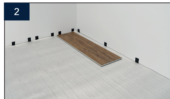
Figure 2: Begin by cutting plank 1 in half. Position the cut end of plank 1 against the wall in the left corner of the room.

It is very important that the first two rows are installed properly. Installation will alternate back and forth between rows one and two, for the first two rows only. The first row of planks will be placed with the grooved edge facing outward into the room.