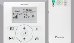
Wired remote controller is optional