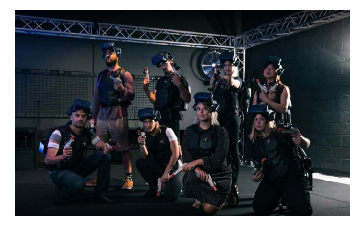
Freak VR, Gold Coast