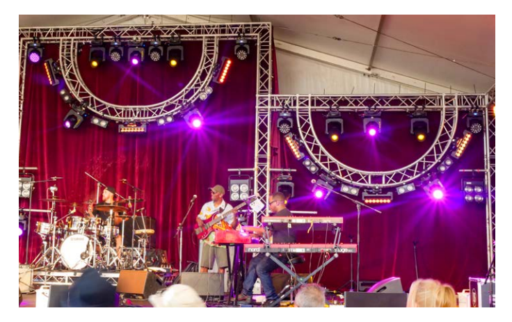
Caloundra Music Festival, Sunshine Coast

Significant Projects: Titan AV highlight specific projects and collaborations that showcase a capacity to deliver reliable, high-quality solutions for both large-scale operations and individual needs.