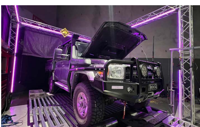
Diesel Tech Fleet Services, Melbourne