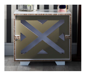
Lisbon Side Table