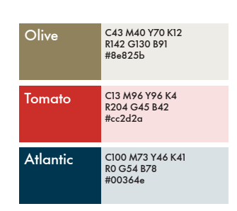
Insert Colour Options