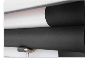
Rubber Roller Feeding System