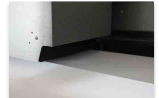
LED UV lamp & Anti-collision unit