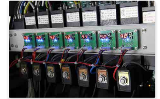
Negative Pressure System