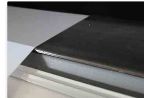
Water cooling platen