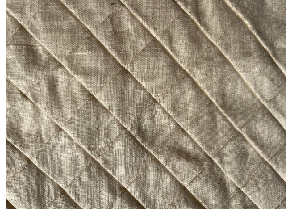
Diagonal Pin Tuck