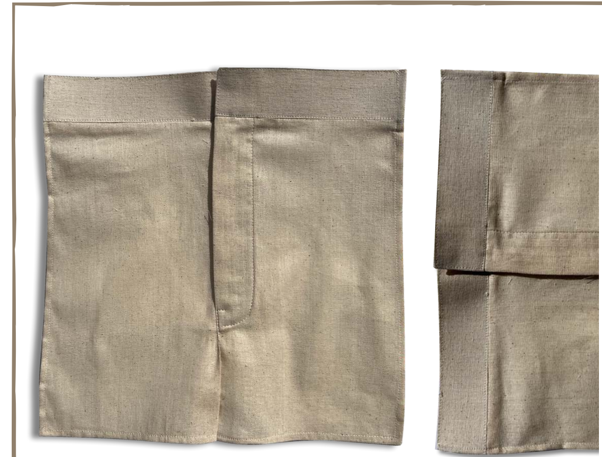
Regular Waist Band