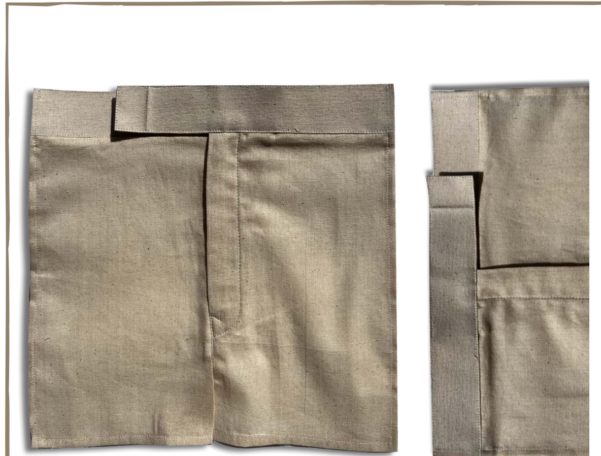
Overlapped Waist Band