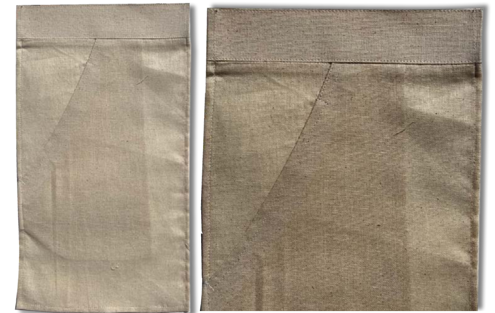
Diagonal Coin Pocket