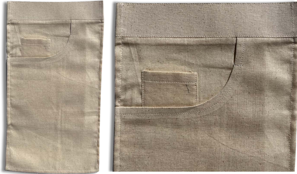
Traditional Five Pocket