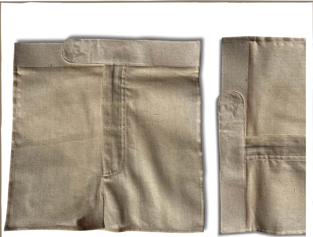
Overlapped Curved Waist Band