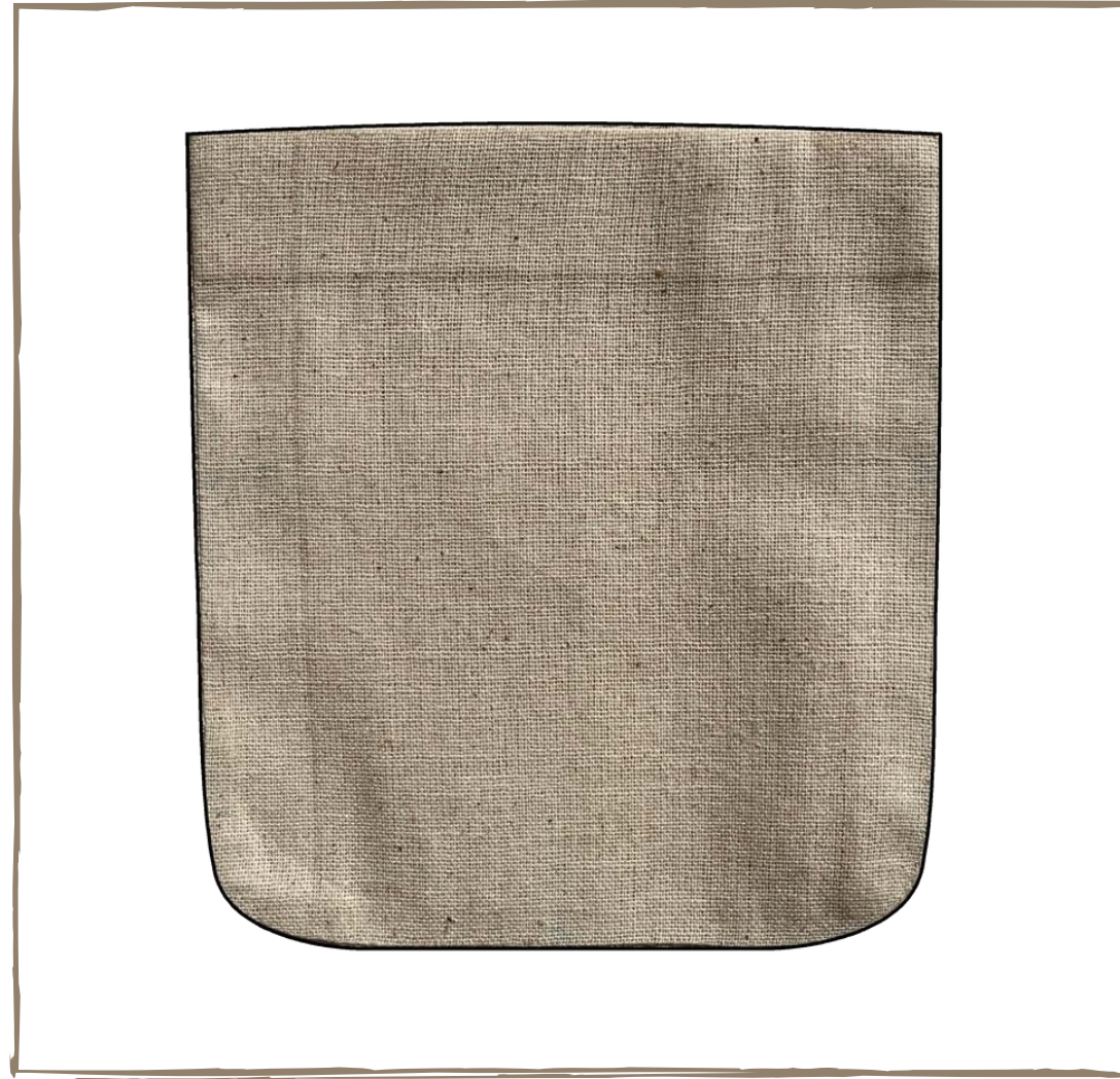
Round Corner Pocket