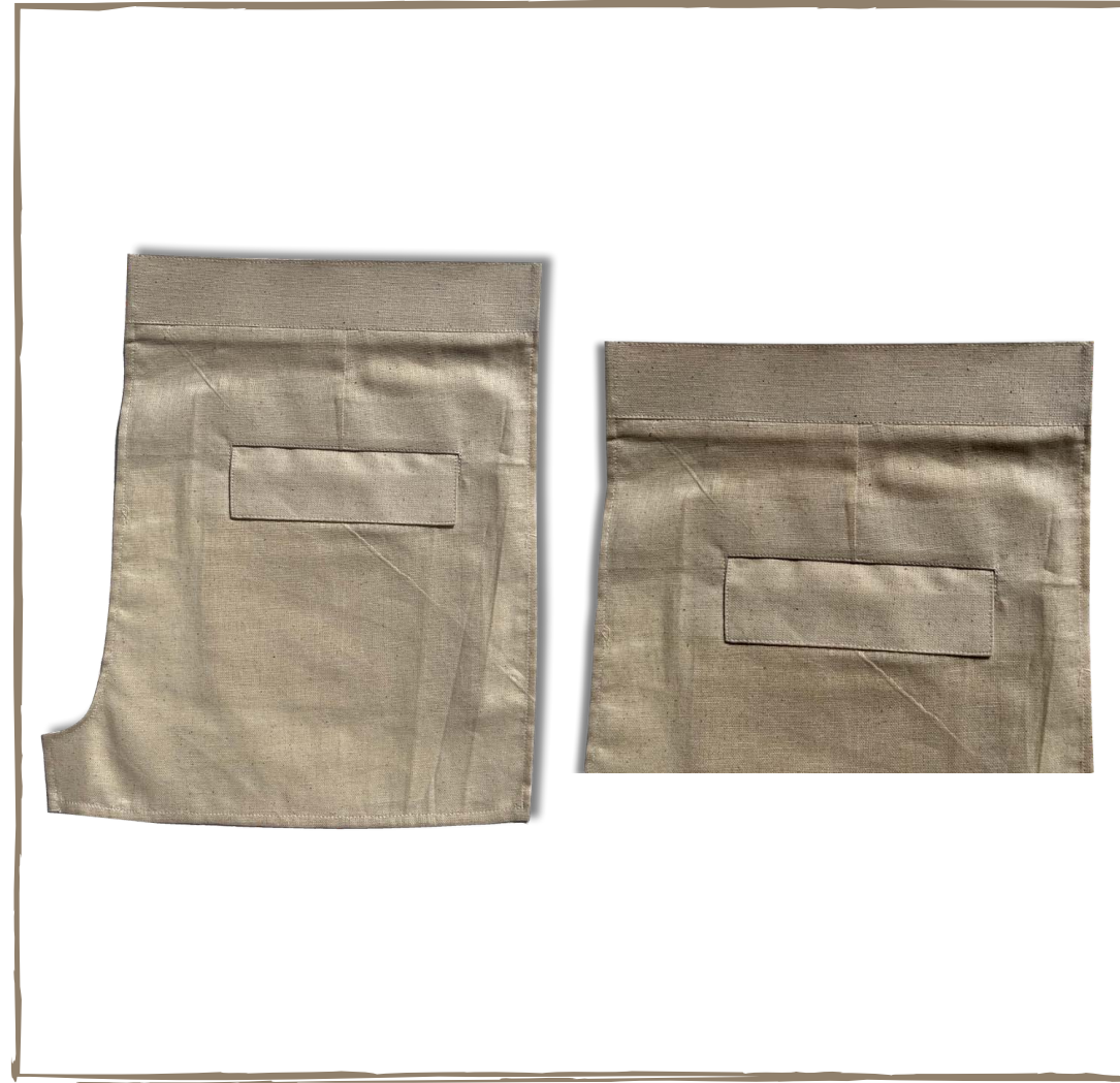
Square Flap Patch Pocket