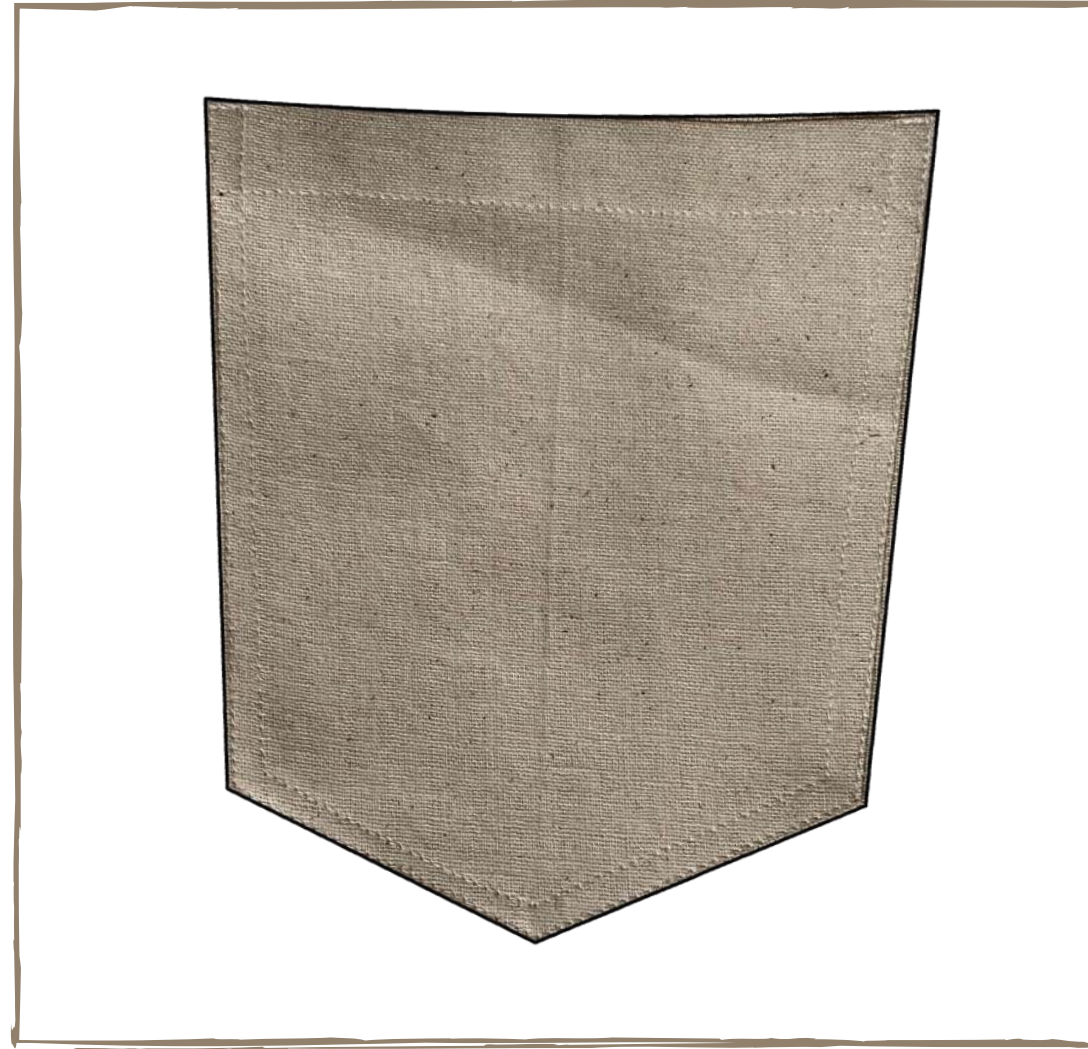
Regular Point Pocket