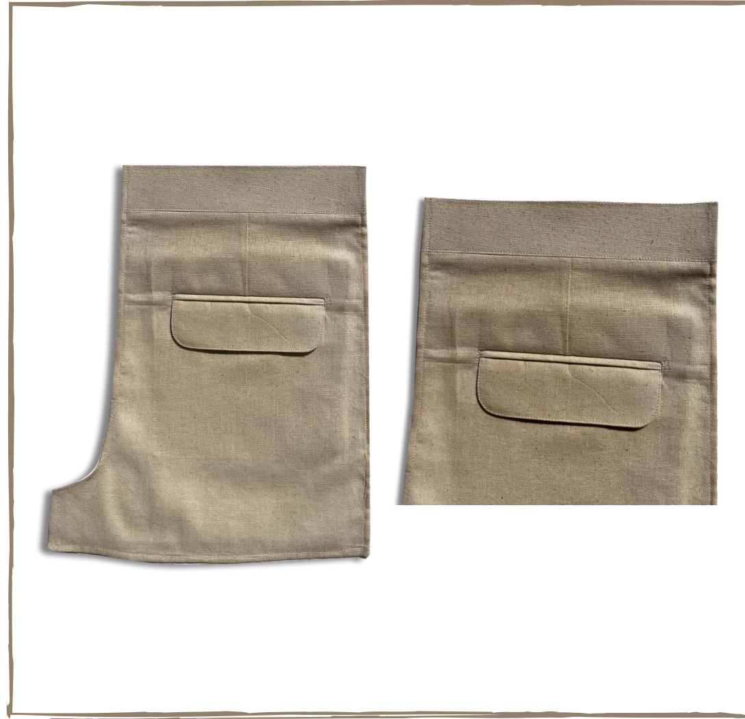
Flap Patch Pocket