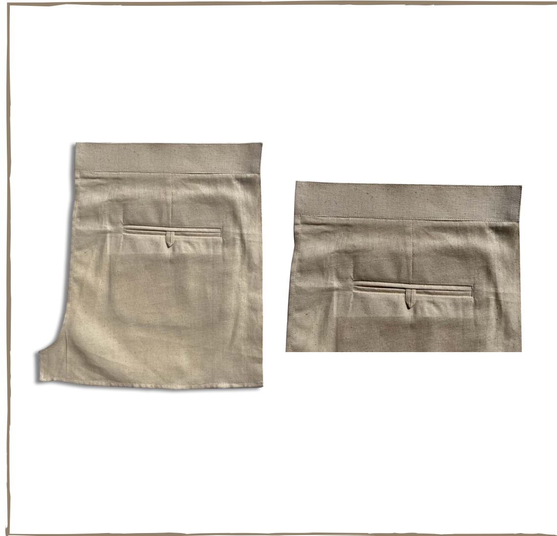
Buttoned Leg Welt Pocket