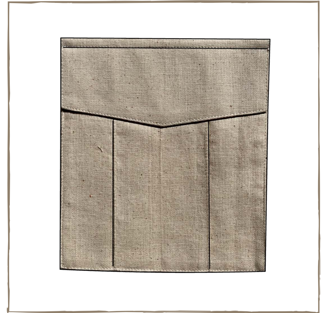
Regular Box Pleat