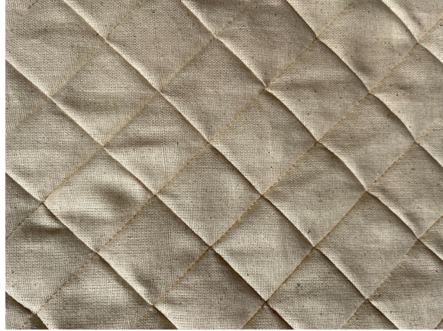
Cross Pin Tuck