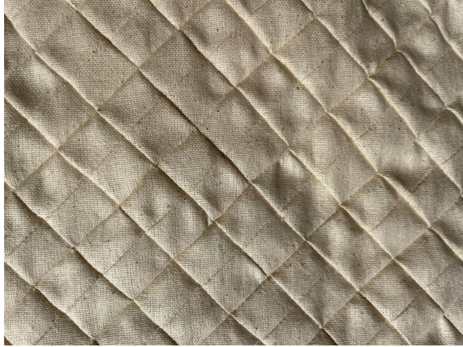
Diagonal Space Pin Tuck