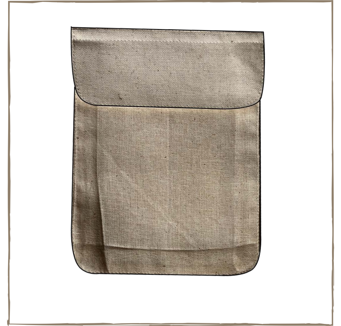
Flap Round Corner Pocket