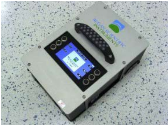
BOT 3000E Machine