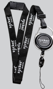
Lanyard - Black AC4100-1692