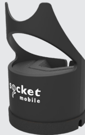
Universal Charging Dock SKU# AC4133-1871