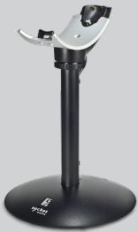
Charging Stand SKU# AC4076-1538