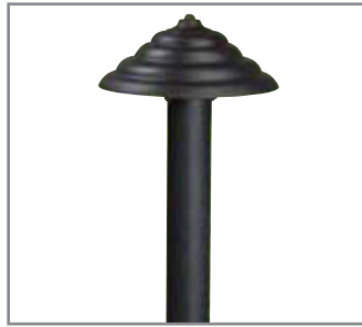
Model: SPJ130-B Finish: Black