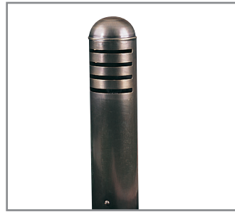
Model: SPJ12-06 Model: Aged Brass