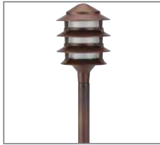
Model: SPJ12-02B-CB Finish: Matte Bronze