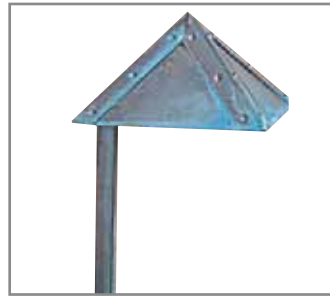
Model: SPJ11-03-TF Finish: Verde