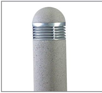
Model: SPJ-R12 Finish: Concrete