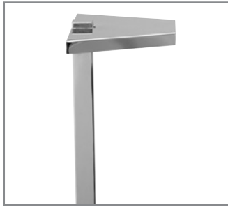
Model: SPJ-TRPL-7 (TRAPEZOID) Finish: PVD-Graphite