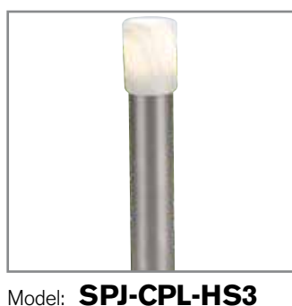
Model: SPJ-CPL-HS3 Shown: PVD Satin / White Onyx