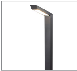
Model: SPJ-3136 Finish: Black