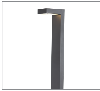
Model: SPJ-3124-RGBW Finish: Black