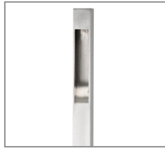
Model: SPJ-CC124-SQ Finish: PVDS