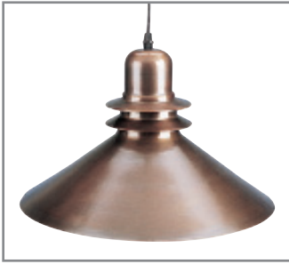
Model: SPJ49-05 Finish: Bronze