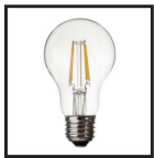
SPJ-A19 12V 2W or 4W

Unlimited LED Lumen Packages & Color Temperatures Available!