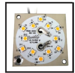
FB-MP1000 120V 10W 1000 LUMENS WARM DIMMING