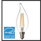
SPJ-2W-CB-C 2W 12V or 120V

Unlimited LED Lumen Packages & Color Temperatures Available!