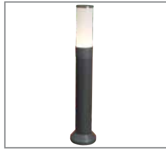
Model: SPJ105-B Finish: Custom Powder Coat