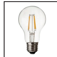
SPJ-A19 12V 2W or 4W